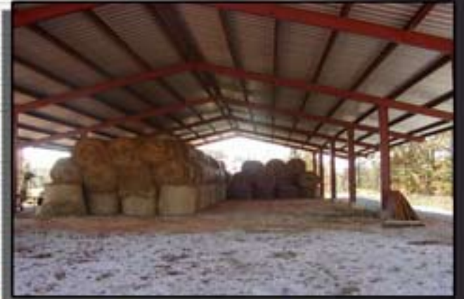
Our Plant, Warehouse, and Offices in Gravette, AR